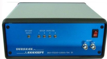
SC-TDC-1000/04 D combining 1 start and 4 stop channels at a time bin resolution of 27.4ps.

Different operating modes enable measurement time ranges up to 44ms. Each stop channel is capable of measuring multiple stops correlated to one start signal (min. pulse pair time distance 5.5ns). Hits at different stop channels are measured without any dead time.