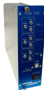
Customized TDC type 03-06-27 (3 start and 6 stop channels at time bin resolution of 27.4ps) housed in a 2/12 unit NIM-module.