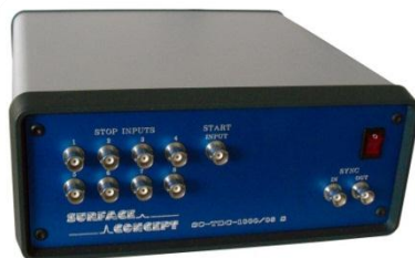
SC-TDC-1000/08 S equipped with 1 start and 8 stop channels with a time bin resolution of 82.2ps.

**can be increased to 80 million results per second by optional FPGA features.